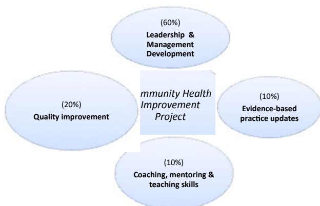
Figure 2. Certificate of Leadership Management and Practice